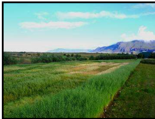
Figure 5. Barley trial in a dry summer in Iceland. Drought damage only occurred where the soil was shallow. Barley growing in deeper (bottom left corner) soils was not affected.

despite very little rain during the summer. Sandier soils types have much less water holding capacities, perhaps around 100 mm, which means that barley is dependent on rain during the growing season. Figure 5 shows this nicely. In 2007, it only rained 50 mm in 60 days in Reykjavík, where Korpa experimental station is located, from the 10 th June to 9 th August. Barley growing in deep heathland soils (bottom left corner of Figure 5) was not affected by this little rain. However, there is a region in the field where soils are quite sandy and barley experienced severe drought stress. This region is represented by a yellow patch in the field. This means that if the water holding capacity of soils is sufficient (around 400 mm) there is very little risk for barley to experience drought stress or damage.