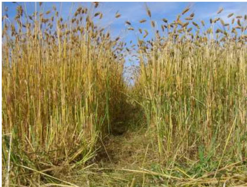
Figure 4. Barley transporting nutrients to seeds. The stem yellows from both ends, starting at the bottom.

During optimal growing conditions, the barley plant will continue to transport starch and other nutrients to the grains until they are filled. During grain maturation, stem and leaves start to yellow from the bottom up. Later in the process the upper part of the stems starts yellowing and lastly the grain itself (see Figure 4).