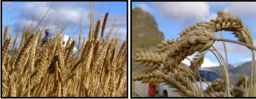
Figure 3. Two-rowed barley on the left (IsKria) and six-rowed on the right (Icelandic breeding line).

The grains of six-rowed varieties are uneven in size and have an average of 45 grains per head, compared to 20 in two-rowed varieties. Despite higher number of seeds, six-rowed varieties are not always higher yielding. The grain size is larger in two-rowed barley and they tend to produce more tillers per plant compared to six-rowed varieties. Breeding of early six-rowed varieties with adequate yield has been more successful than in two-rowed barley. This means that the six-row type is more commonly grown in northern parts of Scandinavia. Cultivation of two-rowed varieties becomes dominant in the southern part of Scandinavia, since they tend to out-perform six-rowed varieties in longer growing seasons and warmer temperatures.