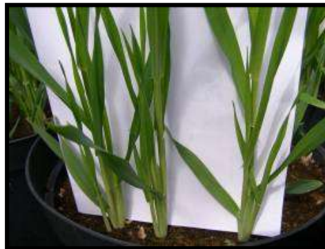
Figure 2. Barley shoots starting to increase in height.

growth stalls for some time at the four-leaf stage, which usually occurs after about 240 GDD from sowing. During the next growth phase, known as tillering, barley plants produce additional shoots. Each plant produces up to three additional shoots. However, experiments have shown that in Iceland the average number of tillers are close to two for 2-rowed varieties and only ½ a tiller for six-rowed varieties. These numbers are likely to vary between environments and cultivars. The number of tillers that are formed will greatly influence the yield potential of a field, since each tiller can form a flower head that will later mature into grains. It is therefore very important that barley plants at this stage have access to sufficient access to nutrients and water, since these environmental factors will greatly contribute to yield of the barley field.